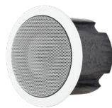
Algo 8188 IP Ceiling Speaker