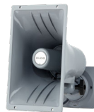
Algo 8186 IP Horn Speaker