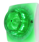
Algo 8138 IP Color Visual Alerter

Algo® is the registered trademark of Algo Communication Products Ltd. All other trademarks are the property of their respective owners.